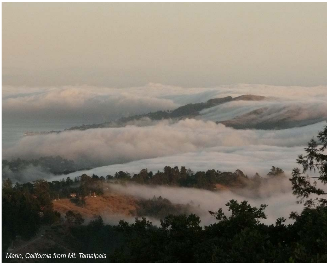
Marin, California from Mt. Tamalpais

The government has taken an active role in reducing tourism's affect on the environment by encouraging quality over quantity. The country attracts adventure tourists seeking hiking and mountain climbing opportunities in a pristine, isolated environment. Bhutan showed the most upward movement in the index, boosted by improved safety and cultural resources scores and a large increase in its entrepreneurship score.