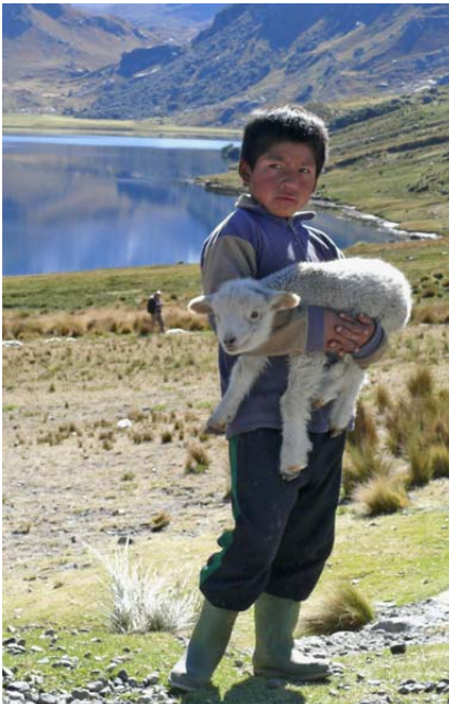
In the Cordillera Blanca, Peru