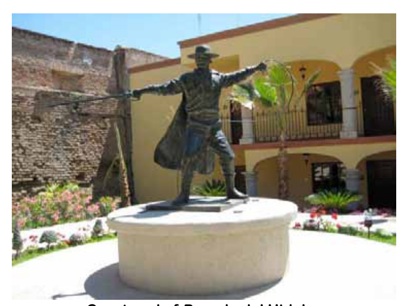
Courtyard of Posada del Hidalgo

Wednesday October 12<sup>th</sup>: Home / El Fuerte. Upon arrival to Mexico City, you will be met by a Journey Mexico representative and check in for your internal flight to Los Mochis. If you would prefer to arrive directly to Los Mochis please advise prior to purchasing your air tickets. Upon arrival to Los Mochis, you will be met by a Journey Mexico representative and head by road to the gateway to the Copper Canyon, the charming colonial town of El Fuerte (2:00 hrs). Time permitting, we will inspect the Hotel el Fuerte and the Hotel Torres del Fuerte and then check in to the historic Posada del Hidalgo. For any early arrivals you may opt to head out onto the El Fuerte River for an optional (and at additional cost) float trip to escape the heat and visit some petro glyphs before returning to town for a visit to the small, but interesting museum. Overnight: Hotel Posada del Hidalgo: <a href="http://www.hotelposadadelhidalgo.com/">http://www.hotelposadadelhidalgo.com/</a> D