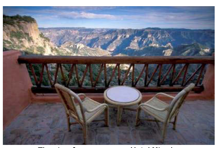
The view from your room Hotel Mirador

We arrive in the early afternoon to Posada Barrancas Mirador (14:00 hrs). It's a short 10 minute transfer to this incredible hotel, it offers sweeping views of the canyon from each and every room. In the afternoon, there will be time for walks around the countryside to enjoy the rugged canyon terrain. Dinner tonight is at the Mansión Tarahumara hotel, a a 15 minute walk each way from our hotel. Overnight: Hotel Mirador: <a href="http://hotelmirador.hotelesbalderrama.com/index.html">http://hotelmirador.hotelesbalderrama.com/index.html</a> B,L,D