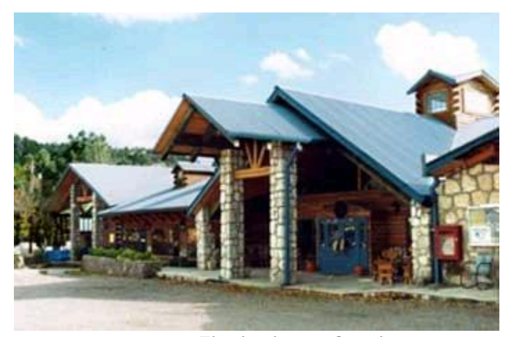
The Lodge at Creel

We will arrive to Creel in the mid-afternoon where you will have time to explore the crafts cooperative and central square before we continue to explore the area stopping at the Valley of the Mushrooms and Monks as well as the Arareko Mission and Lake before finally returning to Creel where we will inspect and check into our hotel The Lodge at Creel. We are invited to dinner at Villa Mexicana tonight. Overnight: The Lodge at Creel: <a href="http://www.thelodgeatcreel.com/">http://www.thelodgeatcreel.com/</a> B,L,D