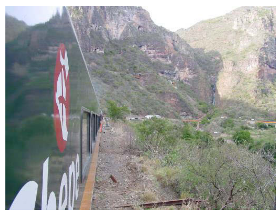
Chepe into the Sierra Madre

We arrive in the early afternoon to Posada Barrancas Mirador (14:00 hrs). It's a short 10 minute transfer to this incredible hotel, it offers sweeping views of the canyon from each and every room. In the afternoon, there will be time for walks around the countryside to enjoy the rugged canyon terrain. Dinner tonight is at the Mansión Tarahumara hotel, a a 15 minute walk each way from our hotel. Overnight: Hotel Mirador: <a href="http://hotelmirador.hotelesbalderrama.com/index.html">http://hotelmirador.hotelesbalderrama.com/index.html</a> B,L,D